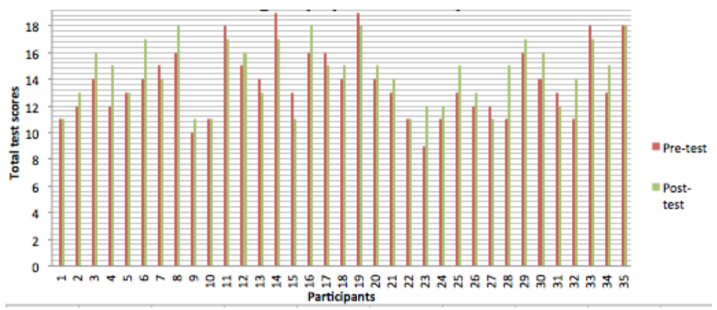
Figure 1: Pretest and posttest results of control group

Having analysed the test data, one can observe that the teaching intervention program influenced learners' lexical learning in the experimental group. The figure below shows the pretest and posttest results of the control group.