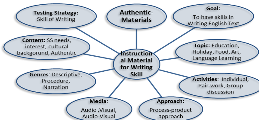
Figure 2 Model of Authentic-Based Instructional Materials for Writing Skill

The figure below shows the model of authentic-based instructional materials for writing skill which is developed through this study. The authentic materials were selected by using some criteria namely: (1) Present real-life English, (2) Present accurate information, (3) Consist of topics of general interest such as friendship, nature, etc, (4) Present the require genres of writing such as: descriptive, procedure, etc, (5) Consists of materials which were considered to be polite in term of context, and (6) Meet the purpose of the audience (students of English Education, UIN Alauddin Makassar). Moreover, the materials were selected by considering the result of the students' need analysis which was taken before developing the model.