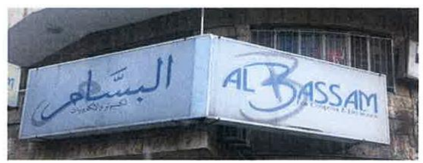
Sign 7. A Bilingual English and Arabic Computer and Electronics Shop Sign

(7) البسام للكمبيوتر والالكترونيات albassa:m lil-kumbyu:tar wal-iliktro:niyyt Al Bassam for computer and electronics 'Al Bassam for Computer & Electronics'