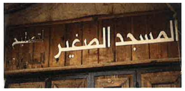
Sign 20. A Watch Shop Sign Demonstrating a Landmark Reference