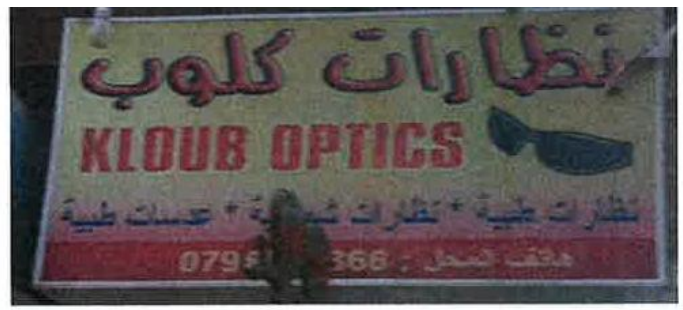
Sign 5. A Bilingual Arabic and English Opticians Sign

نظارات كلوب (5) na<u>th</u>a:ra:t klob optics Kloub 'Kloub Optics'