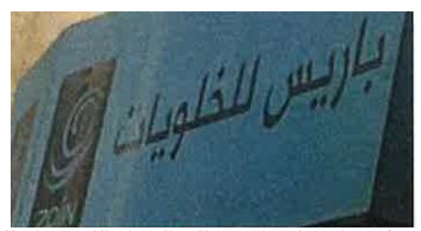
Sign 21. A Mobile Phone Shop Sign Demonstrating a Place Reference