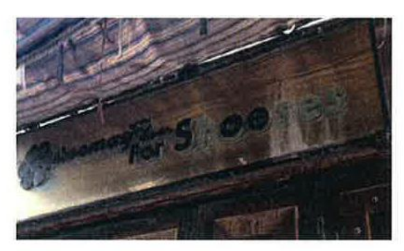
Sign 10. Simple Orthographic Error on a Shoe Shop Sign

Sign 10 illustrates the incorrect form of adding the plural suffix 'es' to the plural word 'shoes'. This reflects the low English proficiency of some shop owners or sign creators. In this context, Kharabsheh et al. (2008: 720) state that "shop owners do not seem to have cared much to consult language specialist or translators".