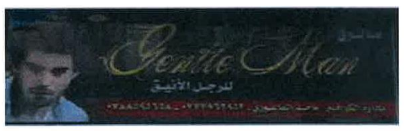
Sign 6. A Bilingual Arabic and English Barber Shop Sign

(6) صالون الرجل الأنيق Salo:n lil-rajul al-?neeq salon for gentleman Gentleman Salon 'Gentle Man'