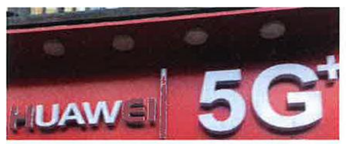
Sign 13. A Mobile Phone Shop Sign along with a Symbol to Indicate Reference