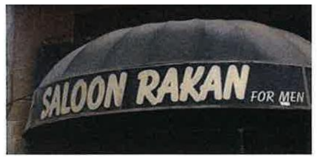
Sign 17. A Monolingual English Sign Exhibiting Word-Order Error