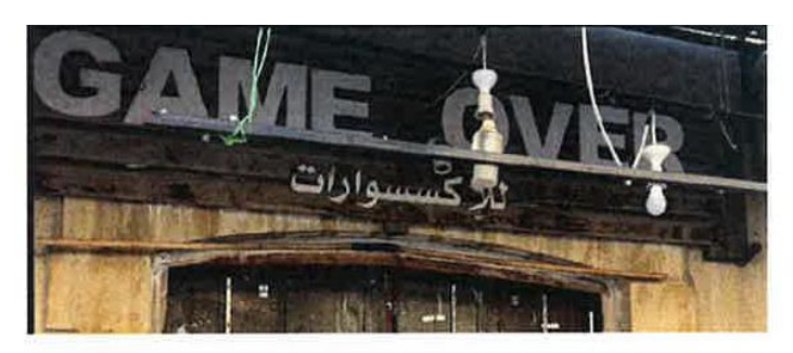
Sign 3. A Bilingual Arabic and English Accessories Shop Sign

9.9 per cent of the signs were Bilingual Arabic and English. Nu`man (cited in Suleiman, 2004:27) considers the use of a foreign language in shop signs as both "linguistic" and "military" invasion of the national language. This 'invasion' can be seen in Amer and Obeidat's (2014) study which reveals that bilingual Arabic and English shop signs have the highest percentage in Aqaba, Jordan (58.1%). The use of Monolingual English is actually very low in Salt (1.0 percent) when compared to Hussein et al.'s (2015) study which shows that 55 per cent of signs were foreign (mostly English) in Sweifieh, 37 per cent in Jabal Al-Hussein and 16 per cent in Al-Wehdat Camp. Amer and Obeidat (2014) find an even lower use of monolingual English shop signs in Aqaba (14%). In this context, the use of monolingual English shop signs requires at least a minimal degree of English proficiency in order to help shoppers in understanding shop signs. Therefore, Salt`s shop owners prefer to use Arabic monolingual shop signs. Below is an example of a bilingual Arabic – English shop sign: