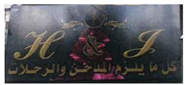
Sign 11. A Shop Sign Showing Abbreviations

Both abbreviations and acronyms were attested in the bilingual Arabic- English shop signs. The abbreviations in sign 11 are written to feature first or family names such as 'Hashim and Jana'. In addition, the conjunction and is reduced to its symbol &.