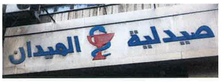
Sign 1. A Monolingual Arabic Pharmacy Sign

As is clear, monolingual Arabic signs constituted 88.6 per cent of all signs analyzed. The high percentage of monolingual Arabic signs in both streets reflects the fact that Salt is a conservative and traditional county in Jordan. In contrast, Hussein et al. (2015) clarify that the percentages of monolingual Arabic signs used in three counties in Amman are: 45 per cent in Al-Wehdat Camp, 27 per cent in Jabal Al-Hussein and 19 per cent in Sweifieh. These percentages prove that Salt is significantly different from Amman, the capital city of Jordan. Salt is in fact more conservative in using the Arabic language which is the native and official language of Jordan. Below is an example of a shop sign that is written purely in Arabic: