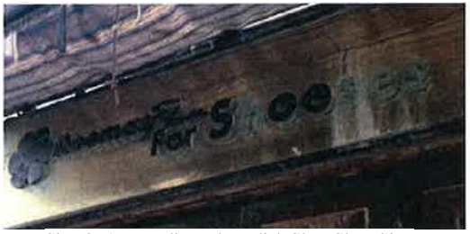
Sign 2. A Monolingual English Shoe Shop Sign

Sign 1 is selected from Prince Hamza Street, Al Salt; it is a pharmacy sign; Saydaliyyat al-maydaan 'The Square Pharmacy'. Both words are Arabic. The structure is a simple noun phrase which is commonly used in Arabic. In contrast, the percentage of monolingual English shop signs was 1.0 per cent. Below is an example: