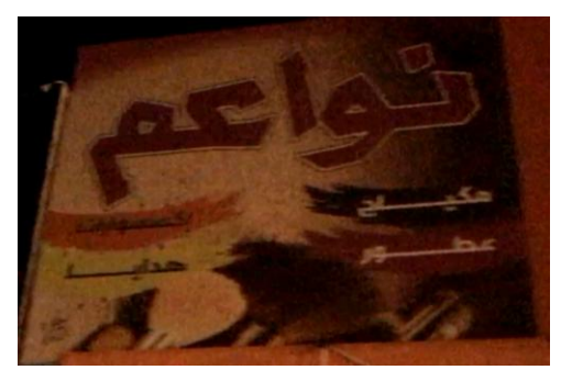
Sign 14. A Make-Up Monolingual Arabic Sign Indicating Connotation