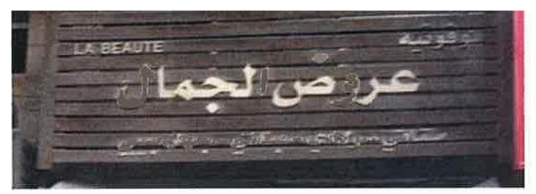
Sign 4. A Bilingual Arabic and French Clothes Shop Sign

The use of languages other than English was found in Prince Hamzih Street (0.3%).