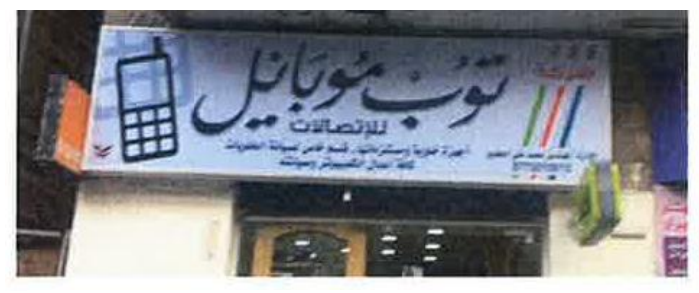
Sign 8. Conversions of English Sounds into Arabic: A Mobile Phone Shop Sign

شرکة توب موبایل (8) sharikat to:b mo:bail company top mobile Top Mobile Company