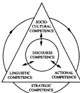
Figure 3: Model of Communicative competence by Celcia Murcia et al (1995)

They put discourse competence at the focal position in which "lexico-grammatical", actional skills of communicative intent and socio-cultural and constitute discourse, which in turn, shapes each of the other three components. The two minor terminological differences between this new model and Canale and Swine model is in that they used the term linguistic competence rather than grammatical competence so as to explicitly indicate that this component comprises lexis and phonology, morphology and syntax. In the same line, they exploited the term socio-linguistic competence to better distinguish it from actional competence. Linguistic competence which plays a substantive role in this model includes the following components.