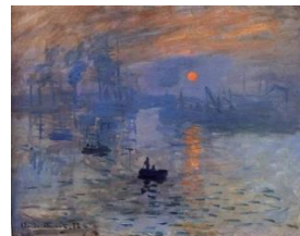
Sunrise by Monet