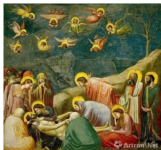
The Mourning of Christ