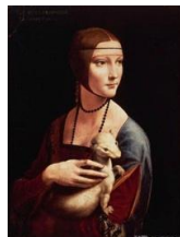
Lady with an ermine by Leonardo da Vinci