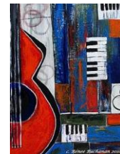
Piano and Guitar by Picasso