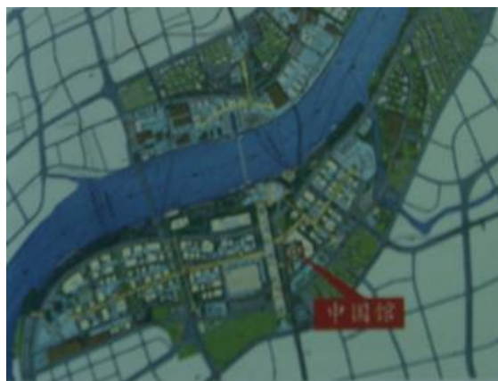
《《中国 2010 年上海世博会概览》, 2008, p.49)