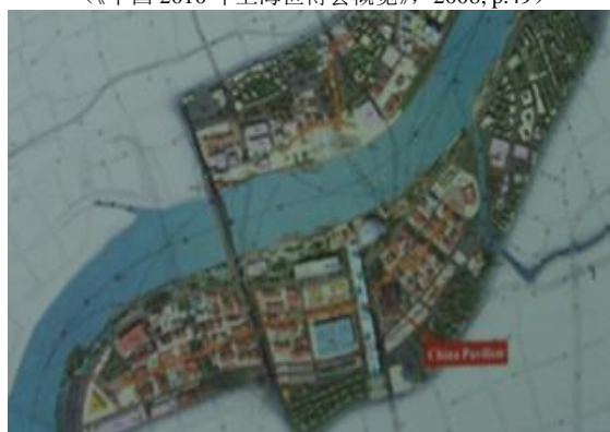
(An Overview of the World Exposition Shanghai China 2010, 2009, p.49)

The two pictures above are used to show the specific position of “中国馆”. Not just the words can express the translators’ will to preserve Chinese culture, the pictures also can do so. From the perspective of Chinese traditional culture, color has the feeling of mystery and the abundant connotation. Red is a color which Chinese think it contains good meaning and represents happiness and luck, like “红娘”, “大红灯笼”. However, westerners are quite different. They relate the color red to blood and danger, like get out the red (不再亏空). Take a look at the two pictures above, in the Chinese version, the bottom color of “中国馆” is red, and in English version, the bottom color of “China Pavilion” is still red. When translating the part of “中国馆”, the translators don’t change the bottom color of red so as to “stress the foreignness of the foreign text” and “contain dissimilarities”. This example aims to let foreigners know about the culture meaning of Chinese color and then receive the dissimilarities between countries.